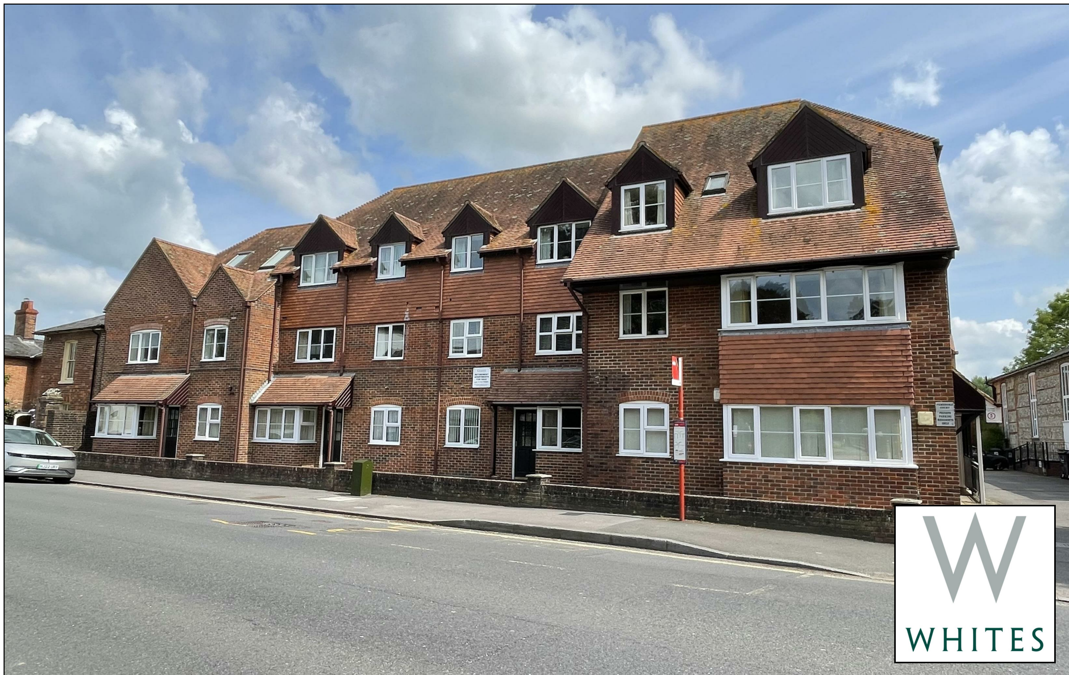
Flat 3, Pembroke Court West Street, Wilton, Salisbury, Wiltshire, SP2 0DG